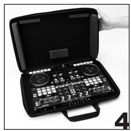
All foams will stick to the lid (velcro) and will remain in fixed position.