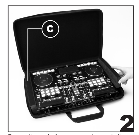
For smaller controllers you can also use both foams (C) for additional side padding