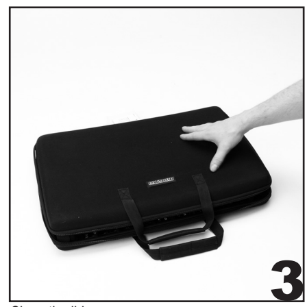
Close the lid now.