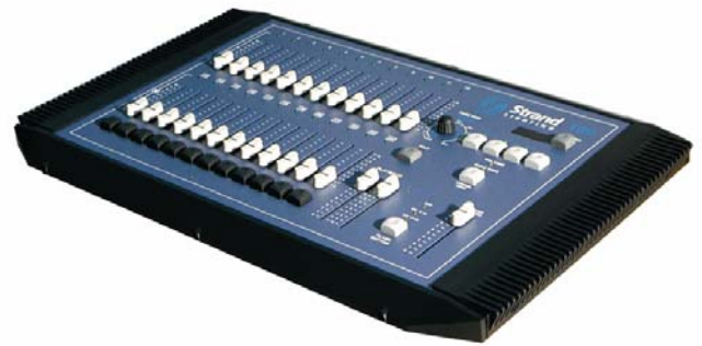
61314 100 Series 12/24 channel console